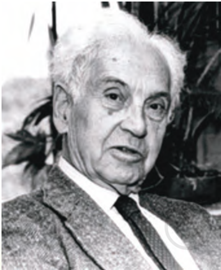
Ernst Mayr (1904 – 2004)

Born on 5 July 1904, in Kempten, Germany, ERNST MAYR, the Harvard University evolutionary biologist who has been called 'The Darwin of the 20 th century', was one of the 100 greatest scientists of all time. Mayr joined Harvard's Faculty of Arts and Sciences in 1953 and retired in 1975, assuming the title Alexander Agassiz Professor of Zoology Emeritus . Throughout his nearly 80-year career, his research spanned ornithology, taxonomy, zoogeography, evolution, systematics, and the history and philosophy of biology. He almost single-handedly made the origin of species diversity the central question of evolutionary biology that it is today. He also pioneered the currently accepted definition of a biological species. Mayr was awarded the three prizes widely regarded as the triple crown of biology: the Balzan Prize in 1983, the International Prize for Biology in 1994, and the Crafoord Prize in 1999. Mayr died at the age of 100 in the year 2004.