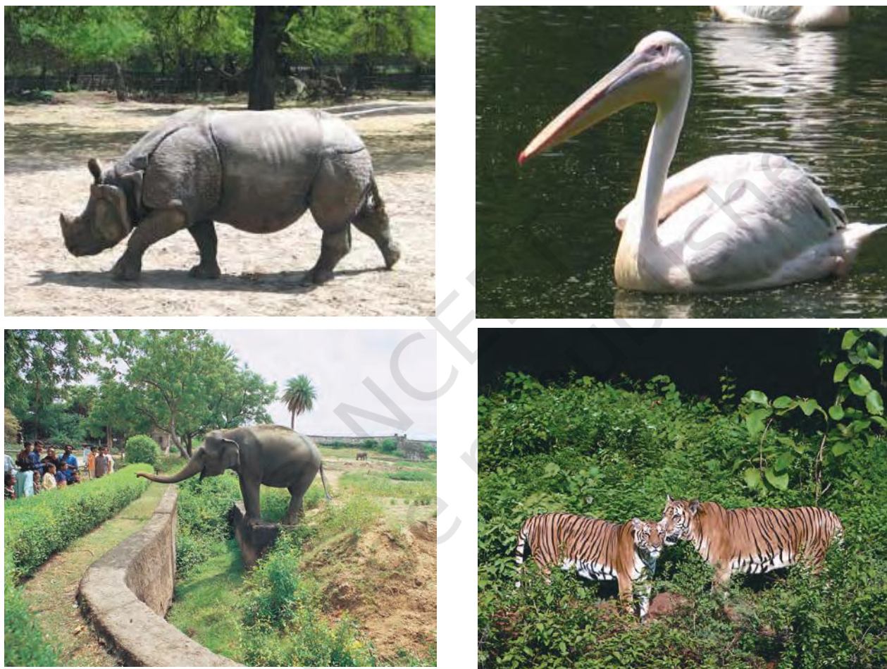
Figure 1.3 Pictures showing animals in different zoological parks of India

These are the places where wild animals are kept in protected environments under human care and which enable us to learn about their food habits and behaviour. All animals in a zoo are provided, as far as possible, the conditions similar to their natural habitats. Children love visiting these parks, commonly called Zoos (Figure 1.3).